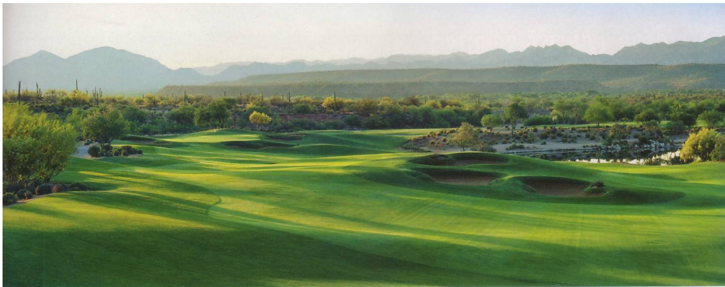
(Above) We-Ko-Pa Golf Club hole 9 on the Cholla Course. The 9th hole on the Cholla Course is a 460-yard par 4 that is as picturesque as it is challenging.