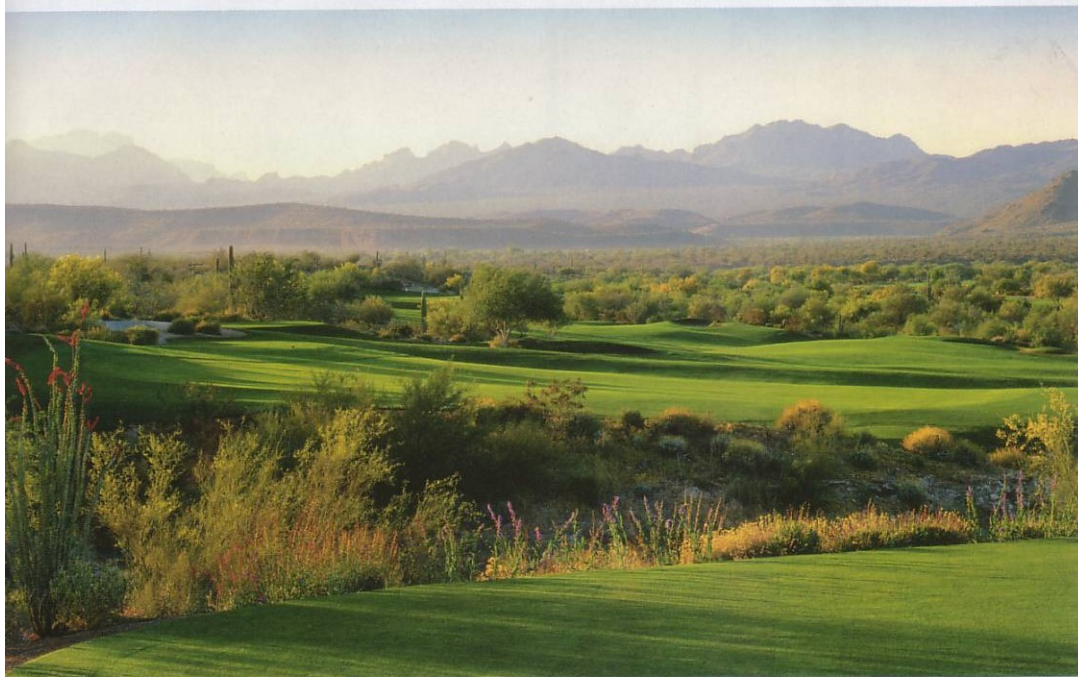
(Left) The 17th on the Scott Miller-designed Cholla Course is a 530-yard par 5.

introduced the all-important art form of tying the entrances to the greens into the greens themselves. The majority of the greens are open in front to allow for run-up shots. It is the subtle pitch and roll of the terrain on the approach to the greens that give each hole much of its unique playing characteristics.