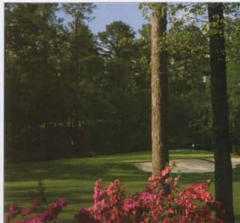
THIS PAGE: (TOP) CACHE CREEK CASINO RESORT; (BOTTOM) DANCING RABBIT GOLF CLUB AT PEARL RIVER RESORT