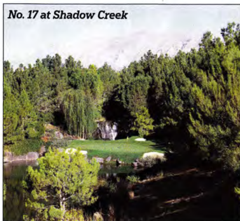
No. 17 at Shadow Creek

a muddled mess, but you can count on Shadow Creek to show up at No. 1 each year on Golfweek's Best Casino Courses list. It also sits at No. 11 on Golfweek's Best Modern (1960-present) list.