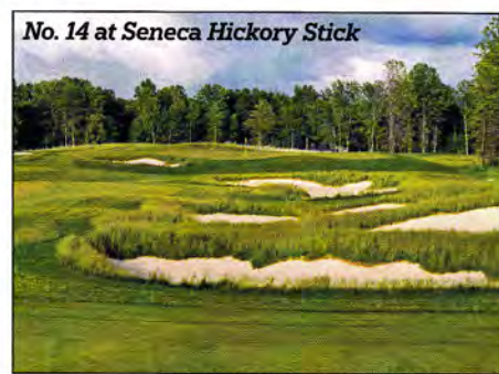
No. 14 at Seneca Hickory Stick