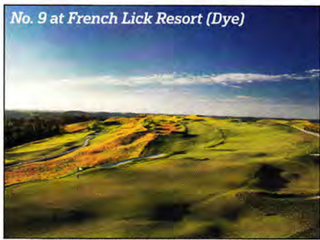
No. 9 at French Lick Resort (Dye)