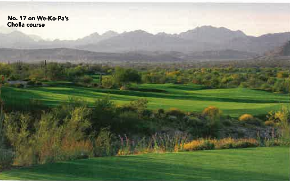
No. 17 on We-Ko-Pa's Cholla course

Now Albanese is nearing completion of Sweetgrass' sister course, Sage Run, which figures to be the U.P.'s next destination course.