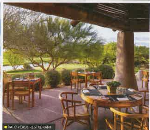
■ PALO VERDE RESTAURANT

lively dining experience can also be had at the Spotted Donkey Cantina at el Pedegral, an outdoor shopping and culinary area that is part of the resort's sprawling property.